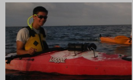
A $10 quick dry t-shirt is easy to find at Wal-Mart or Target