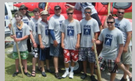
You may already have board shorts or running shorts that are comfortable and dry quickly in your closet