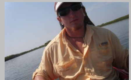
Don't skimp on a long sleeve quick dry button up